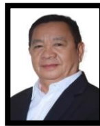
Rodolfo Abellana Vocational Service